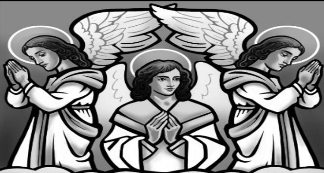
Ss. Michael, Gabriel, Raphael