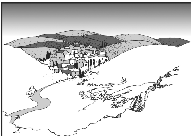
Jesus was led by the Spirit into the desert

During Lent, we should take our discipline a step further and begin to ask ourselves what it is in our lives that is keeping us from having a better relationship with God and His Holy Church. If we take an honest look at our lives and our relationship with the Lord, all of us can certainly find some things that shouldn't be there. As we begin our bodily and spiritual discipline of Holy Lent, let us find what those habits, temperaments, pleasures of the world, what our sins might be, and let us give up those things for Lent. Let us commit that those distractions which are keeping us from the relationship with God that we should have will not return to our lives after Easter, let us pledge to get rid of them once and for all.