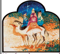
Magi from the east arrived