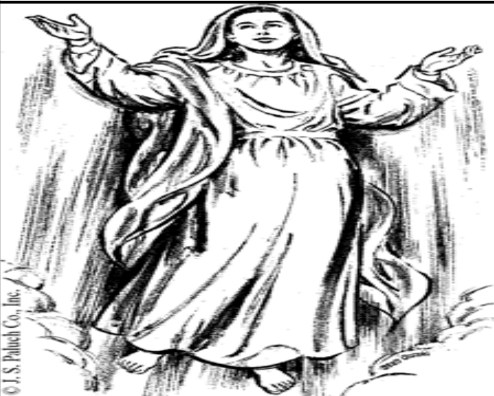
Assumption of the Blessed Virgin Mary

Baptism Class: Mandatory Baptism Class for Parents and Godparents is held on the First Thursday of each month at 6:30 pm at the Guadalupe Chapel. Parents must make arrangements for the Baptism at the Church Office at least two weeks prior to the class. ALL PAPERWORK MUST BE COMPLETE PRIOR TO THE CLASS. The next Class will be held: Thursday, September 2, 2021.