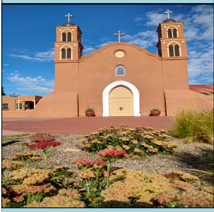
Parish Vision Statement

We Strive to Bring People Closer to God." (Adopted August 5, 2008)