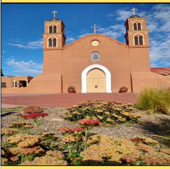
Parish Vision Statement

Míssíon Statement We Strive to Bring People Closer to God." (Adopted August 5, 2008)