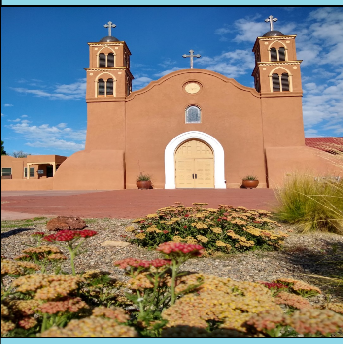
Parish Vision Statement

Míssíon Statement We Strive to Bring People Closer to God." (Adopted August 5, 2008)